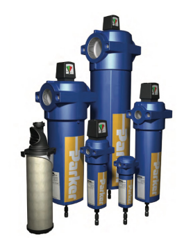
Bag and Cartridge Filters