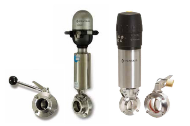
Sanitary Butterfly Valves